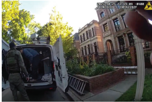
Image 4 CBP Body Worn Camera/CHC Litigation viii