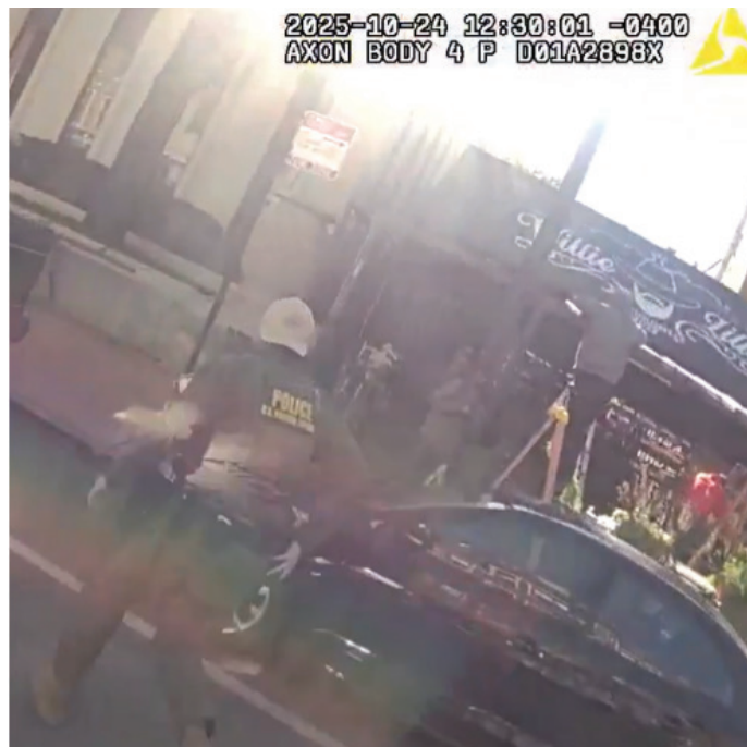
Image 2 CBP Body Worn Camera Footage iv

Around 11:30 AM, the same three agents and an additional unmarked vehicle with at least three other agents, pulled over when they saw construction workers outside of Willie Lill's Spirits & Kitchen on West Diversey Parkway near North Pine Grove Avenue in the Lakeview neighborhood. Body worn camera footage shows the federal vehicle stop and the driver immediately exit the vehicle and run across the street towards Individual A, who had headed towards the restaurant's front door once the agents' vehicle stopped. iii The agent grabbed Individual A, held pepper spray to their face, placed them in their unmarked vehicle and then handcuffed them. There is no indication that agents had a reasonable suspicion of criminal activity or unlawful presence in the United States and appeared to stop them solely based on his apparent race and presence at a construction site. Additionally, there is no evidence that agents had sufficient probable cause to justify an arrest of Individual A or that agents were justified in using pepper spray to effectuate the arrest. The individual remained in the agent's unmarked vehicle throughout the morning, including when the agents deployed tear gas as described below.