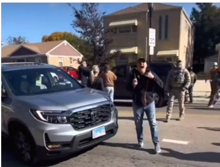
Image 3: Source – Bystander video of Goodwill seconds after being sprayed iii

The scene finally began to settle down when approximately 10 agents and 20 members of the public were present in the aftermath of the crash. liii