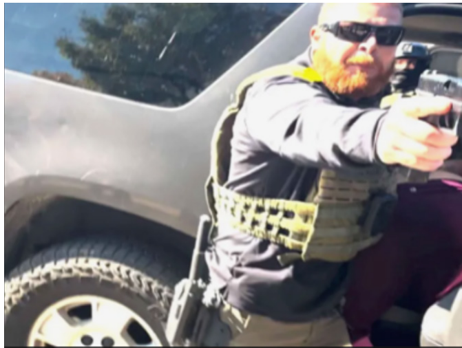
Image 2 Bystander video of gun pointed at Brooks and other bystanders xlii